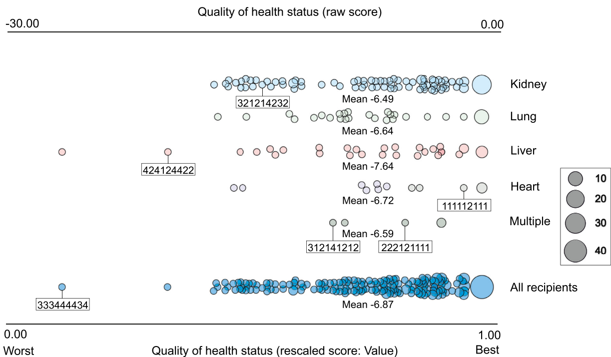
Fig. 3. The distribution of computed TXP values obtained for respondents in the HealthSnApp.

organ recipients reported a high level of HRQoL. We also found out that there is no substantial difference between the overall health states of different solid organ recipients.